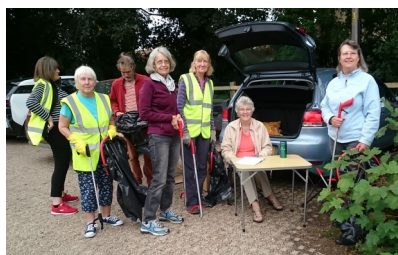
WI Members ready for action!

Woolpit WI were early birds in supporting the Great Big Green Week. Keen to be involved we joined the Village Litter Pick at the beginning of September. The event was promoted by the Parish Council, and organised by Parish Councillor, Lynda Moore who is also one of our members. Ten WI members participated and with the help of other villagers we were able to cover all areas of the village. A surprisingly small amount of rubbish was collected but this may be due to the efforts of community minded parishioners who litter pick regularly. The Parish Council were grateful for the WI support; it was good to see two organisations working together.