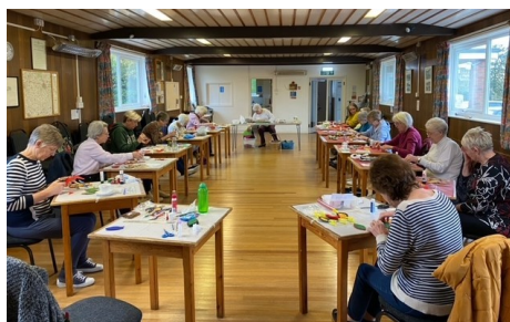
Chevington deep in concentration

It was a lovely day and we all enjoyed being together with the opportunity to catch up on news and gossip as we worked.