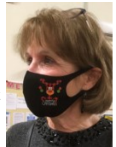
Penny in her festive mask

Yes, we had to observe the safety protocols - the hand-held microphone regularly sanitised, face masks optional during the singing of the closing carols, but the combined efforts of the committee and members made it a memorable evening. The parting wish: Good Health for All in 2022.