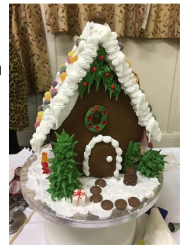
A festive treat!

Andrea demonstrated how to fit the sections of the house together with royal icing. This then needs to be left to set so in true Blue Peter fashion Andrea produced one she had prepared earlier to decorate. You could hear a pin drop in the Hall as members were held spellbound as the house gradually came to life. The roof was covered in "tiles" and the walls were given trailing ivy and even a wreath over the door. Green icing trees and bushes were added to the garden and stepping stones as a path.