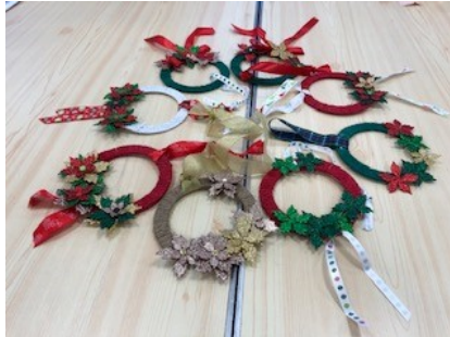
Jolly festive creations

First we had to wrap wool around a circle with a hole in the middle. This brought back memories of making woollen pom poms. We then chose ribbon and sparkly decorations, which we pinned on. We were all very proud of our decorations and mine is already hanging up at home.