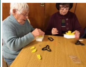
Having a stab at it

As you might guess, we all started slowly, then picked up a bit of speed with several "ouches." It took concentration, a lot of therapeutic stabbing and a bit of "this doesn't look like a flower!" but just look at our amazing creations!