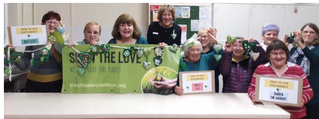
Glemsford gals: "We only have one planet!"

Over in the south of Suffolk, Glemsford WI made green hearts and banners and displayed them at their village hall and Sudbury QH WI pitched up at Sudbury Library and shared the love, handing out the hearts to planet conscious book lovers.