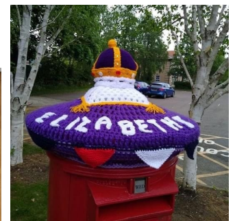
Outside Moreton Hall Post Office