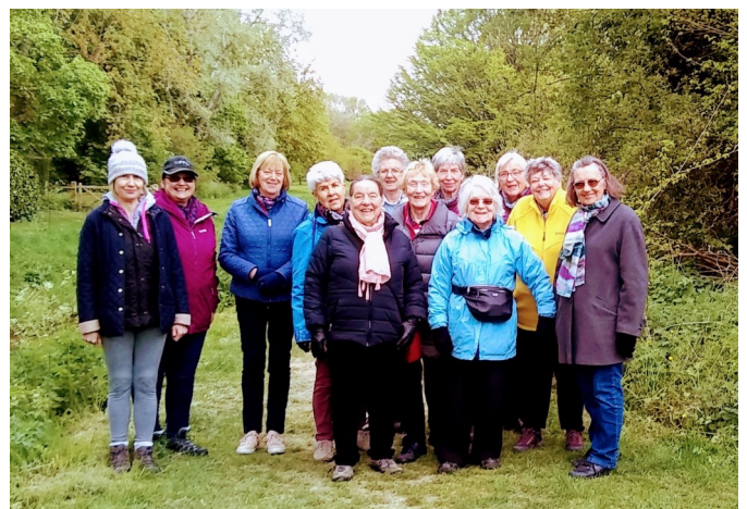
Kedington WI Members