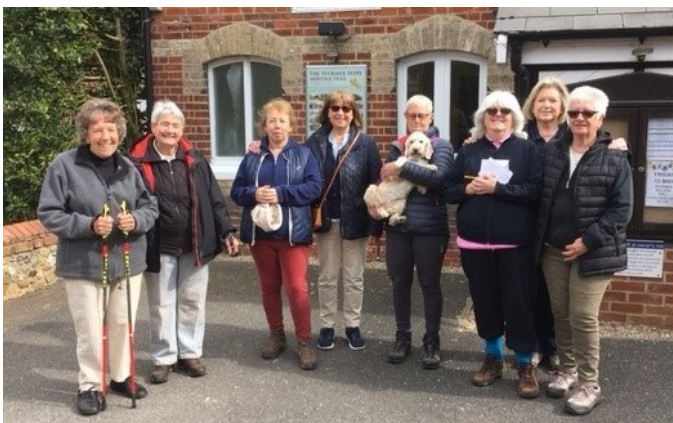
Sturmer WI Members Ready to Set Off!