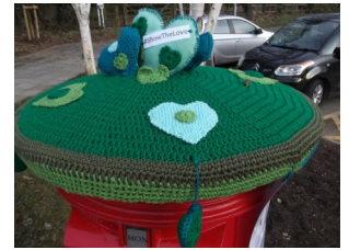
Show the Love Feb 22