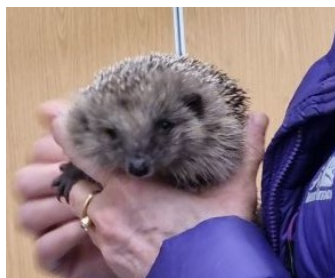
Greta the Hedgehog