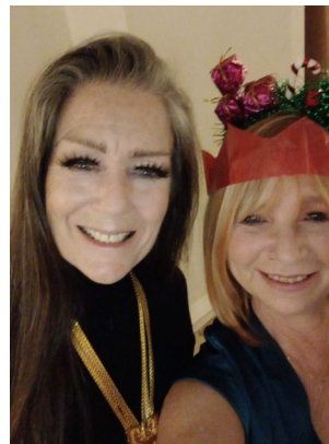
Surprise guest Lorraine Chase of Campari fame

In December we enjoyed a meal at the Bull, where a surprise celebrity popped in to chat with us all. If you remember an advert for Campari, where Lorraine Chase was not wafted from Paradise but Luton Airport, you will recognise our visitor. Lorraine chatted about various pantomimes and told a few tales of life on stage.