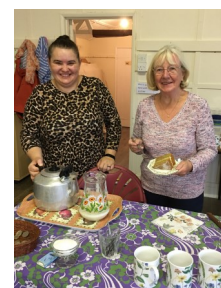
WI serve up tea & cake

It’s hoped people who attended gained an insight into what goes on at the hall on a weekly basis. To book our hall contact Jackie Fieldsend on 01440 820108.