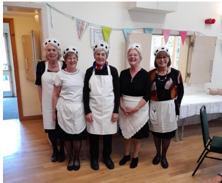
Pakenham WI Waitresses

Literally hundreds of wonderful people spent an enjoyable afternoon in the village hall celebrating the Queen's