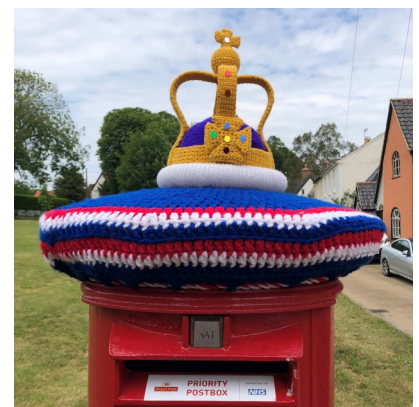
A very royal post box