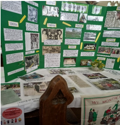
Rickinghall's WI display