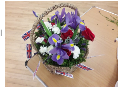
Jubilee floral tributes