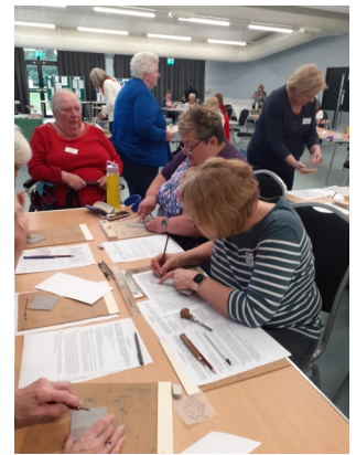
Members design their own lino cuts