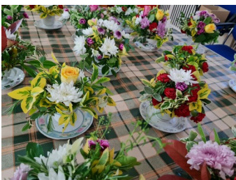
Beautiful floral creations

Haverhill Owls WI After all the business and Annual Meeting was completed, members settled down to make a floral table decoration in a tea cup. Under the guidance of members Pat and Sue, we chose our flowers and foliage and set to work. After a few false starts, some laughter and groaning, and the