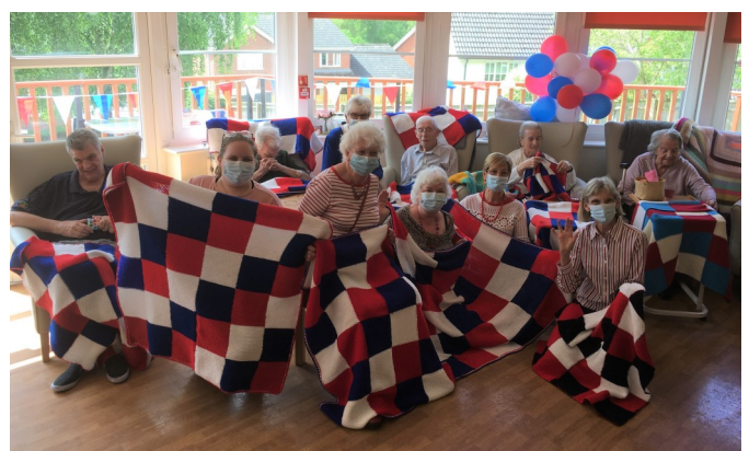
Sudbury QH with the Hillside residents