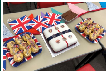
A spread fit for a Queen