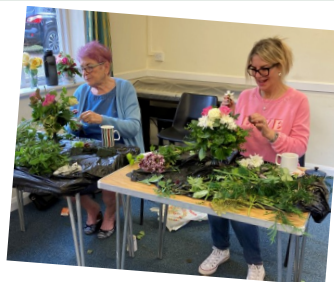
Members getting creative