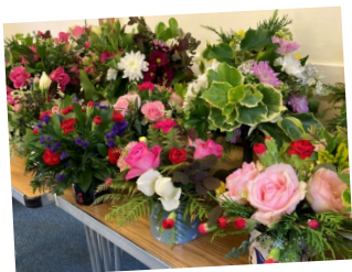
Members floral creations

Everyone went home with two delightful and very professional looking arrangements, a Mug Mound (an ideal gift!) and a table arrangement, using the beautiful flowers provided and sharing the greenery