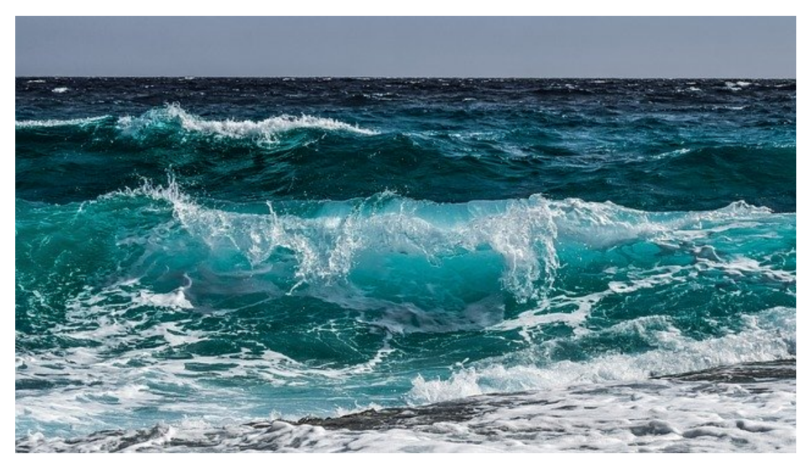
The Environment Bill and Plastic Pollution Bill

The Environment Bill finally returned to Parliament on the 3rd of November.