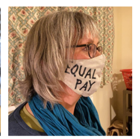
Equal Pay Day: 20<sup>th</sup> November

The Fawcett Society have confirmed that Equal Pay Day 2020 (the day in the year when women effectively, on average, stop earning relative to men) will fall on 20<sup>th</sup> November.