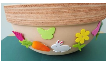
Sue Walker's Easter Pot