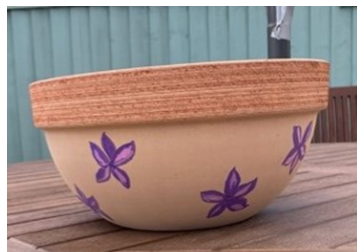
Purple pot by June Bunn