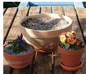
Kirstie Ford's Creation