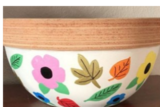
A scattering of leaves and flowers by Irene