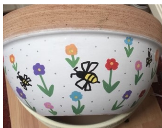
Colourful collection by June Bryant