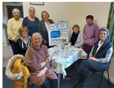
Sterling Stanton WI Ladies

A representative came to accept the cheque and explained how important donations have been during the pandemic and will continue to be in the future.